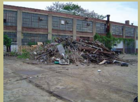
Brownfields redevelopment efforts can incorporate sustainable technologies and fixed-fee remediation programs.