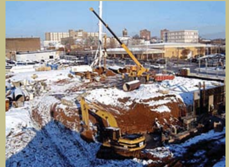
From initial due diligence through construction/remediation, Whitestone provides an array of professional services.