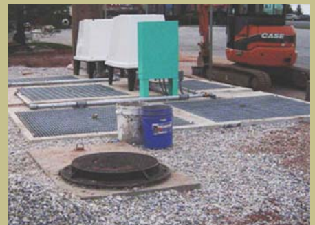
Wastewater treatment system designs utilize state-of-the-art capabilities to ensure compliant operation.