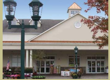
Whitestone specializes in commercial and retail site development and redevelopment efforts.